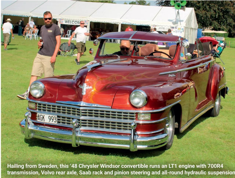
Hailing from Sweden, this '48 Chrysler Windsor convertible runs an LT1 engine with 700R4 transmission, Volvo rear axle, Saab rack and pinion steering and all-round hydraulic suspension

'I hope everyone had a very enjoyable long weekend. A number of new faces will be on the committee next year, so I will be back again in a new capacity as a paying participant. It will be nice to catch up with some of the many friends I've made while being on the committee. See you all next year for the 33rd Supernationals.'