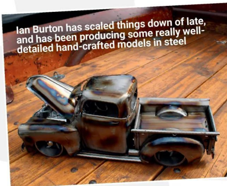
Ian Burton has scaled things down of late, and has been producing some really well-detailed hand-crafted models in steel